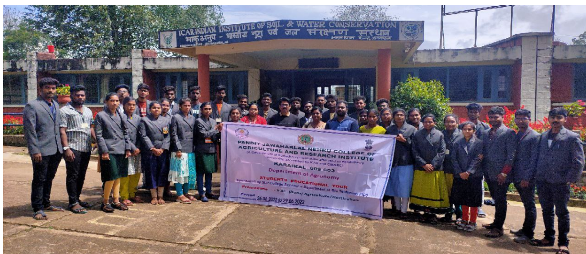
ICAR – Indian Institute of Soil and Water Conservation, Research Centre - Ooty

DATE: 28.06.2022 VISIT TO ICAR - INDIAN INSTITUTE OF SOIL AND WATER CONSERVATION, RESEARCH CENTRE, UDHAGAMANDALAM