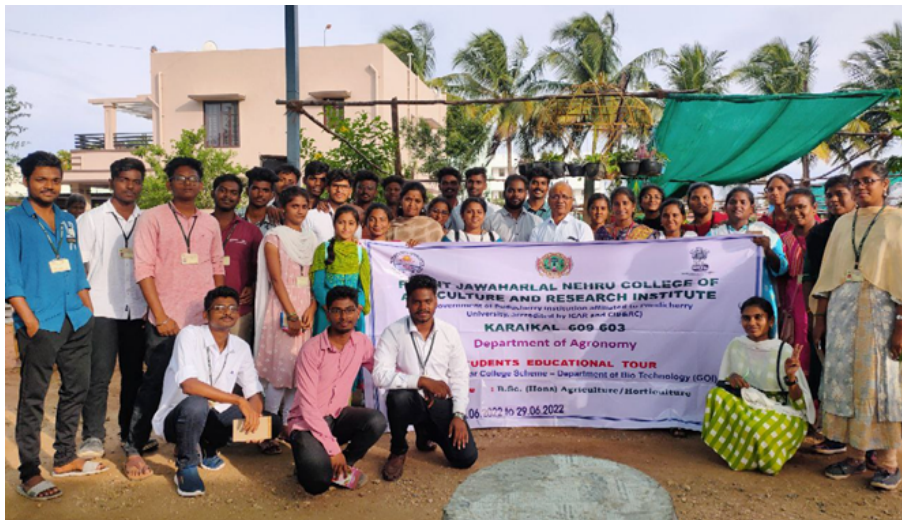
Sri Balaji Roja Nursery, Coimbatore

DATE: 27.06.2022 VISIT TO SRI BALAJI ROJA NURSERY, COIMBATORE