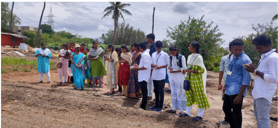
Crop component – Kitchen garden & fodder crops