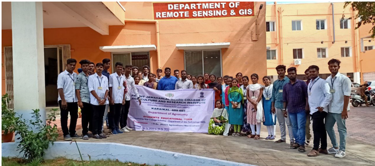
Department of Remote Sensing and GIS, TNAU