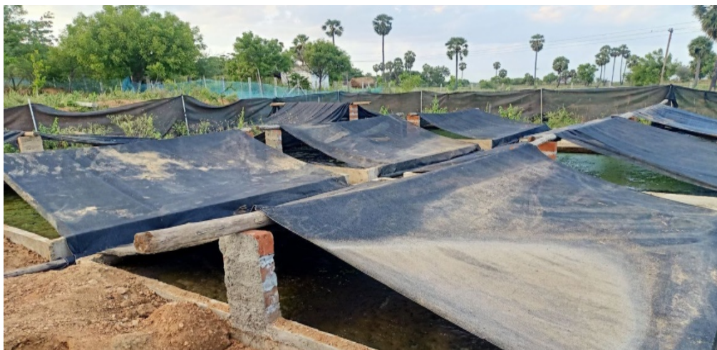
Azolla Production Unit