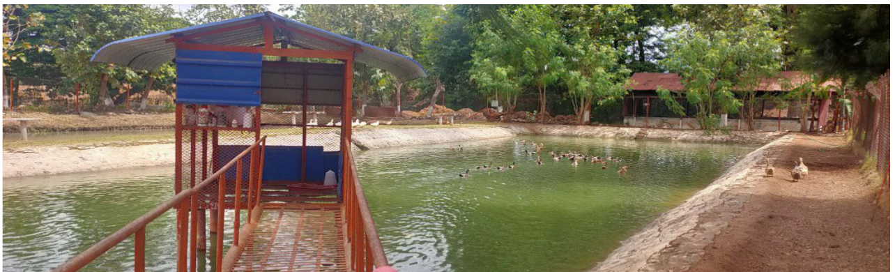
Poultry and Fishery Unit - Wetland Ecosystem