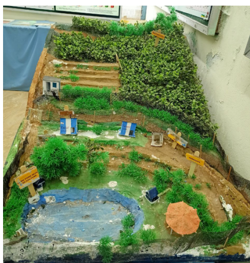
Soil and water Conservation model displayed in ICAR - IISWC