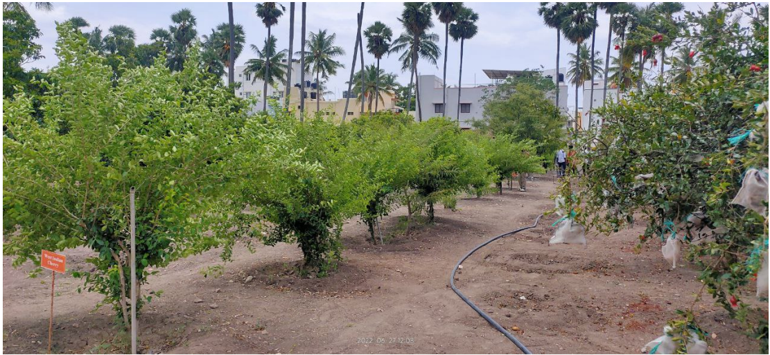
Crop component – West Indian Cherry & Pomegranate