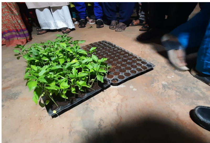
Vegetable Seedlings in Protrays