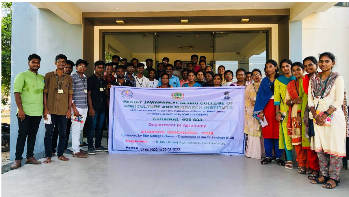
Rasi Seeds (P) Ltd, Attur, Salem

DATE: 29.06.2022 VISIT TO RASI SEEDS (P) LIMITED, ATTUR SALEM