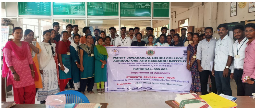
Soil Testing Lab, Coimbatore