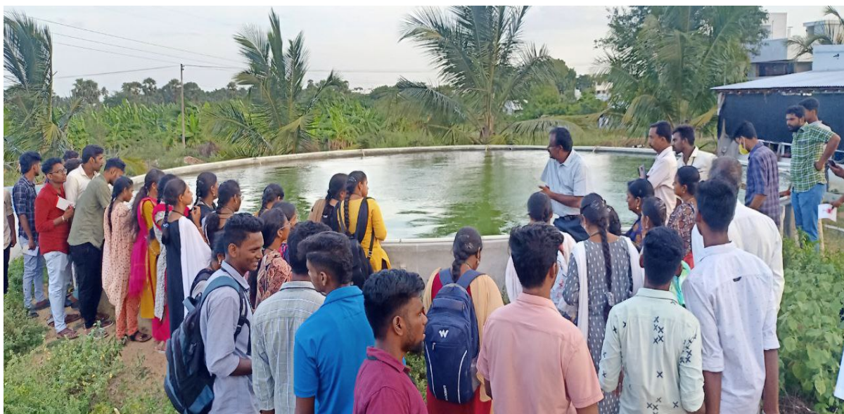
Composite fish culture