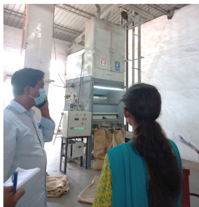
Seed Processing Unit