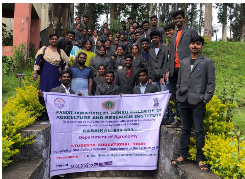
Medicinal Theme Park, Ooty

DATE: 28.06.2022 VISIT TO MEDICINAL THEME PARK, UDHAGAMANDALAM