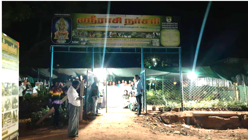
Sri Rasi Nursery, Vridhachalam

DATE: 29.06.2022 VISIT TO SRI RASI NURSERY, VRIDHACHALAM