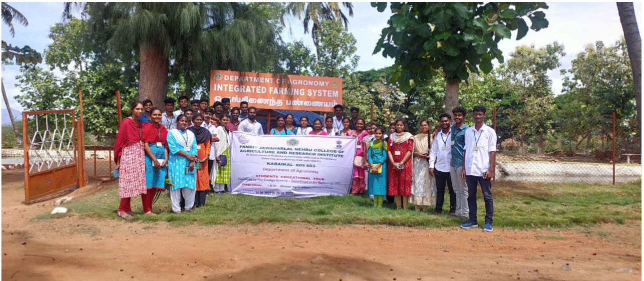
IFS, Department of Agronomy, TNAU Coimbatore

DATE: 27.06.2022 VISIT TO IFS UNIT AT TNAU, COIMBATORE